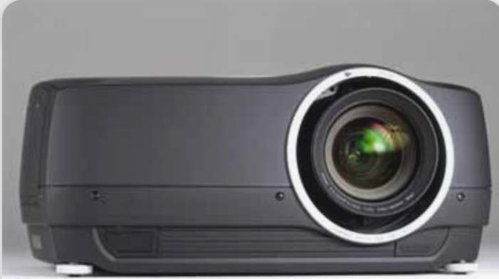
The F35 WQXGA features 2560x1600 resolution, two individual lamps, full 24/7 warranty up to five years, and a very large range of precision projection lenses and other customization options.